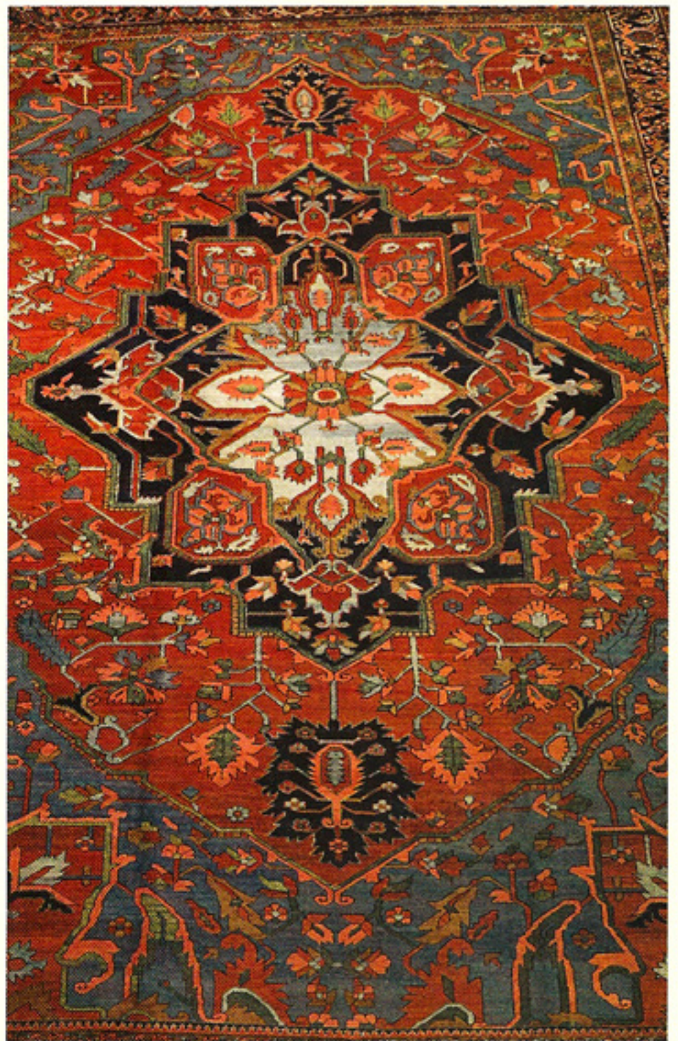
Above: An antique Serapi, circa 1900 sold at Pashgian Brothers in Pasadena.